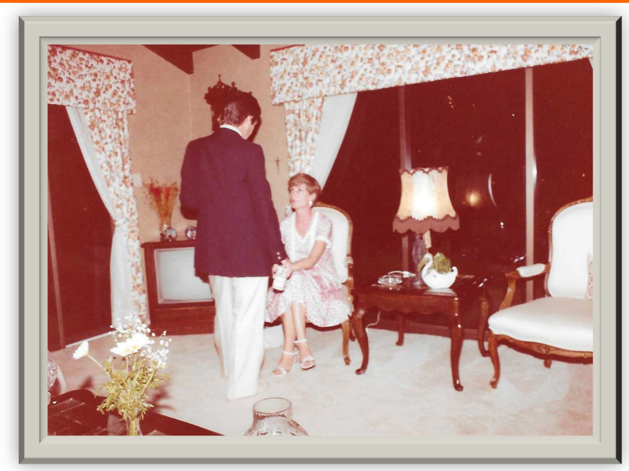
Always kept in touch... And we visited each others homes much.