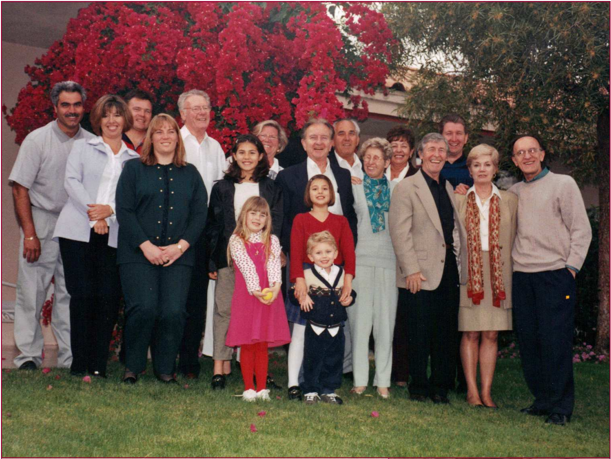
Palm Desert 02-01-1998