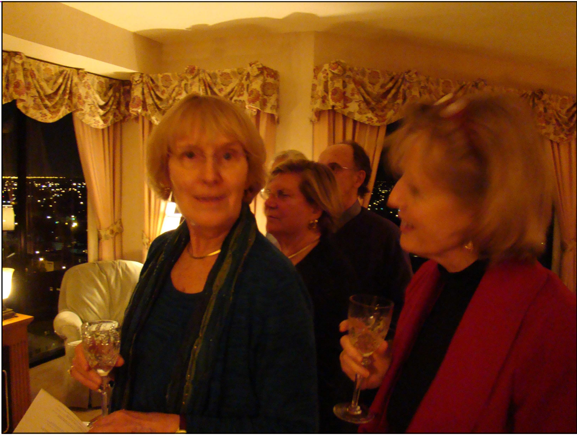
Long Beach 01-01-2011 Watching the fireworks of the Queen Mary