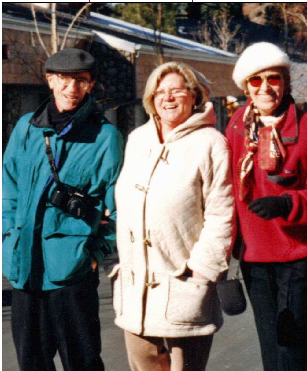
Arrowhead 12- 1997