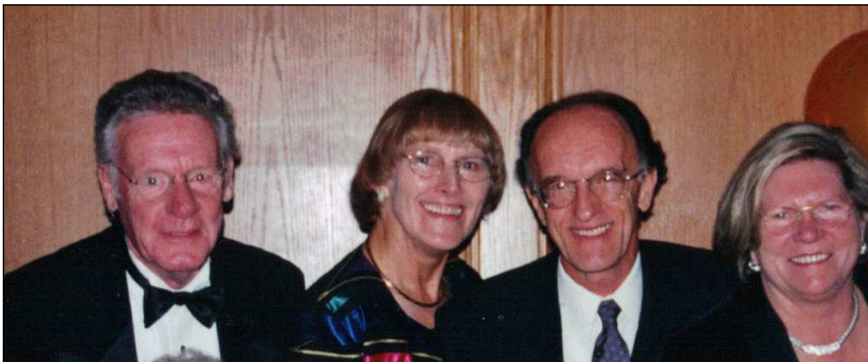
Marina Del Rey -1997