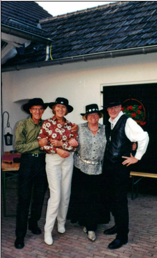
07-28-2001 Broekhuizen The Netherlands