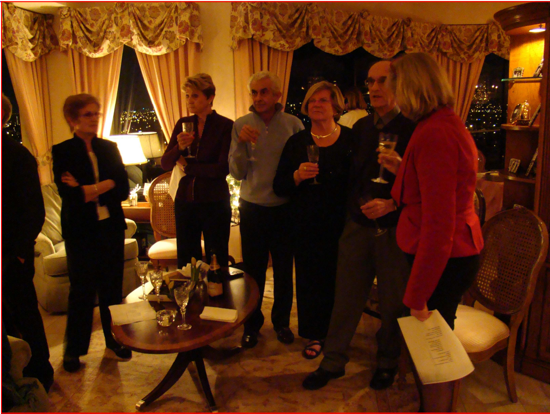
Long Beach 01-01-2011