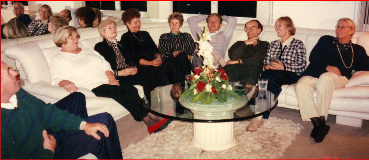
Long Beach 12-31-1996