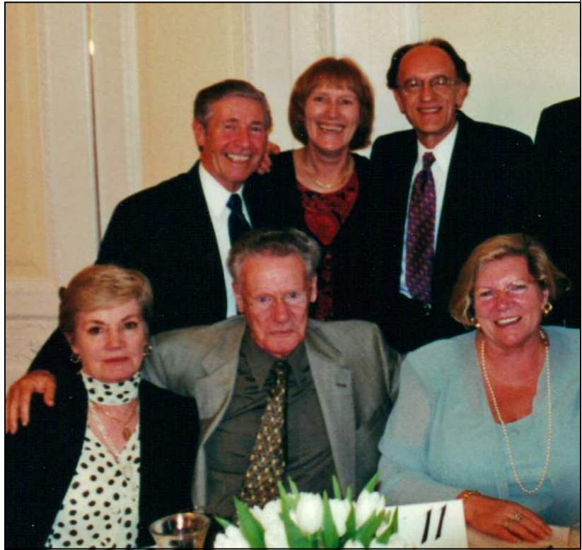
04-21-2001 Providence R.I.