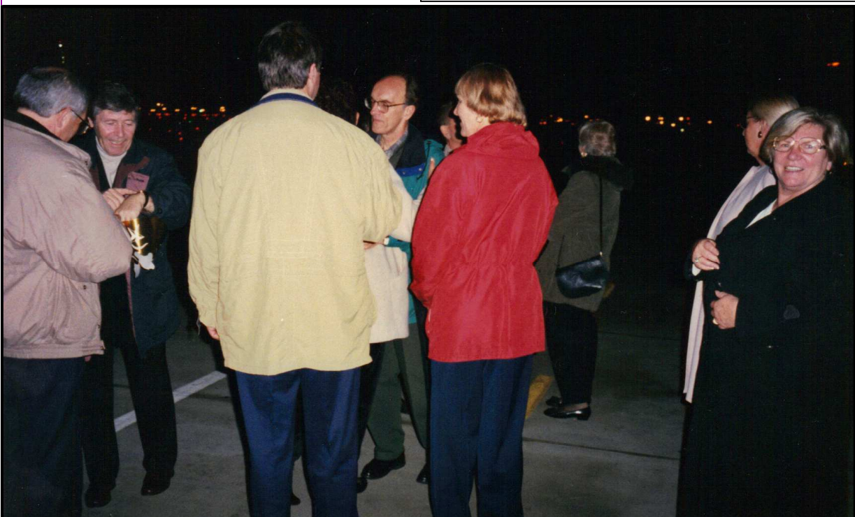
Long Beach 01-01-1997